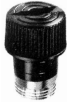
585 Cap SLOTTED TOP FOR 5x20MM FUSE